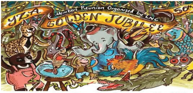
Past Members Reunion Organized by LNG